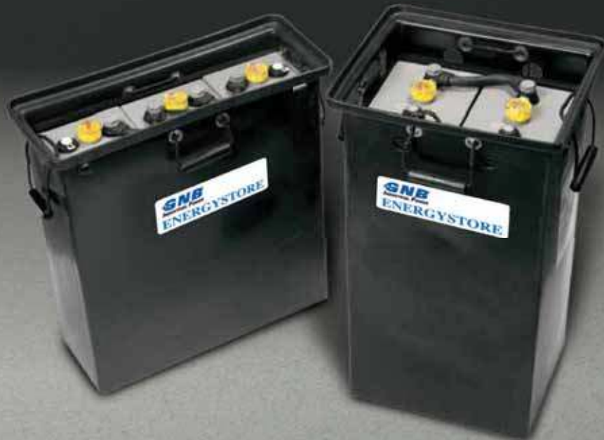
INCP DESIGN INT 2005 2011

Exide Technologies takes pride in its commitment to a better environment. Its Total Battery Management program, (an integrated approach to manufacturing, distributing and recycling of lead acid batteries), has been developed to ensure a safe and responsible life cycle for all of its products.