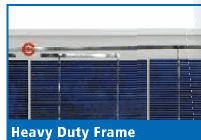
Heavy Duty Frame

Provides better impact resistance and improved light transmission