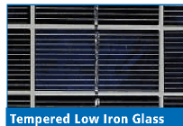
Tempered Low Iron Glass

Protects against external elements and includes connection terminals