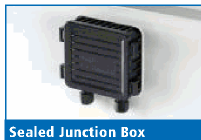
Sealed Junction Box

Protects against external elements and includes connection terminals