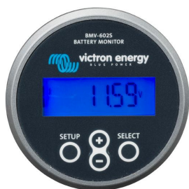
BMV 602S Black

No prescaler needed. Note: RJ45 connectors are galvanically isolated from Controller and shunt.