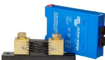
VE.Net Battery Controller