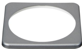
BMV bezel square